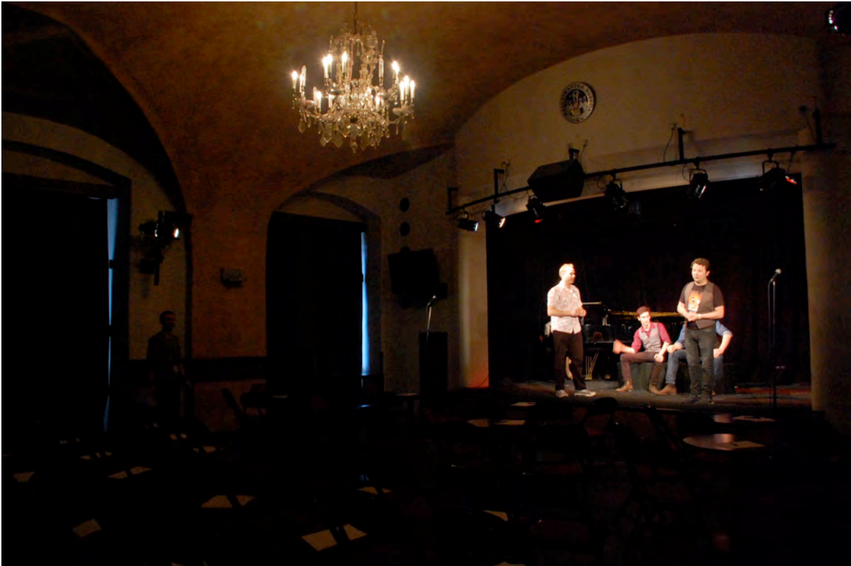
Stage from audience entrance (Men With Coconuts)